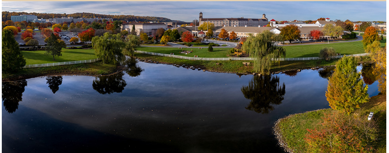
Photos or Maps courtesy of Hershey Entertainment & Resorts Company. Hershey Lodge ® is a trademark used with permission.

Full details and specifications at prpsconferencenandexpo.org .