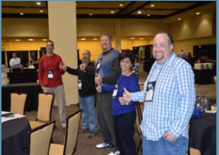
Conference Opening Keynote, Lancaster

The Society's members include managers of municipal and state recreation and park systems, recreation therapists and wellness specialists, higher education professors and students, managers and programmers of commercial recreation facilities, suppliers and manufacturers of recreation and park products and services, and citizen members of community recreation and park boards across the Commonwealth.