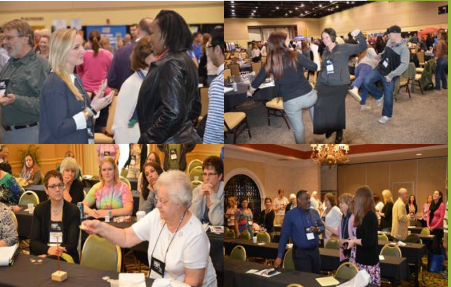
Members are why PRPS exists! A high level of engagement characterizes these scenes from the Annual Conference in March and the PA Therapeutic Recreation Institute in June.