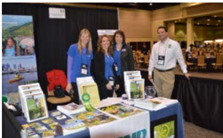
DCNR information booth, PRPS Conference, Lancaster.