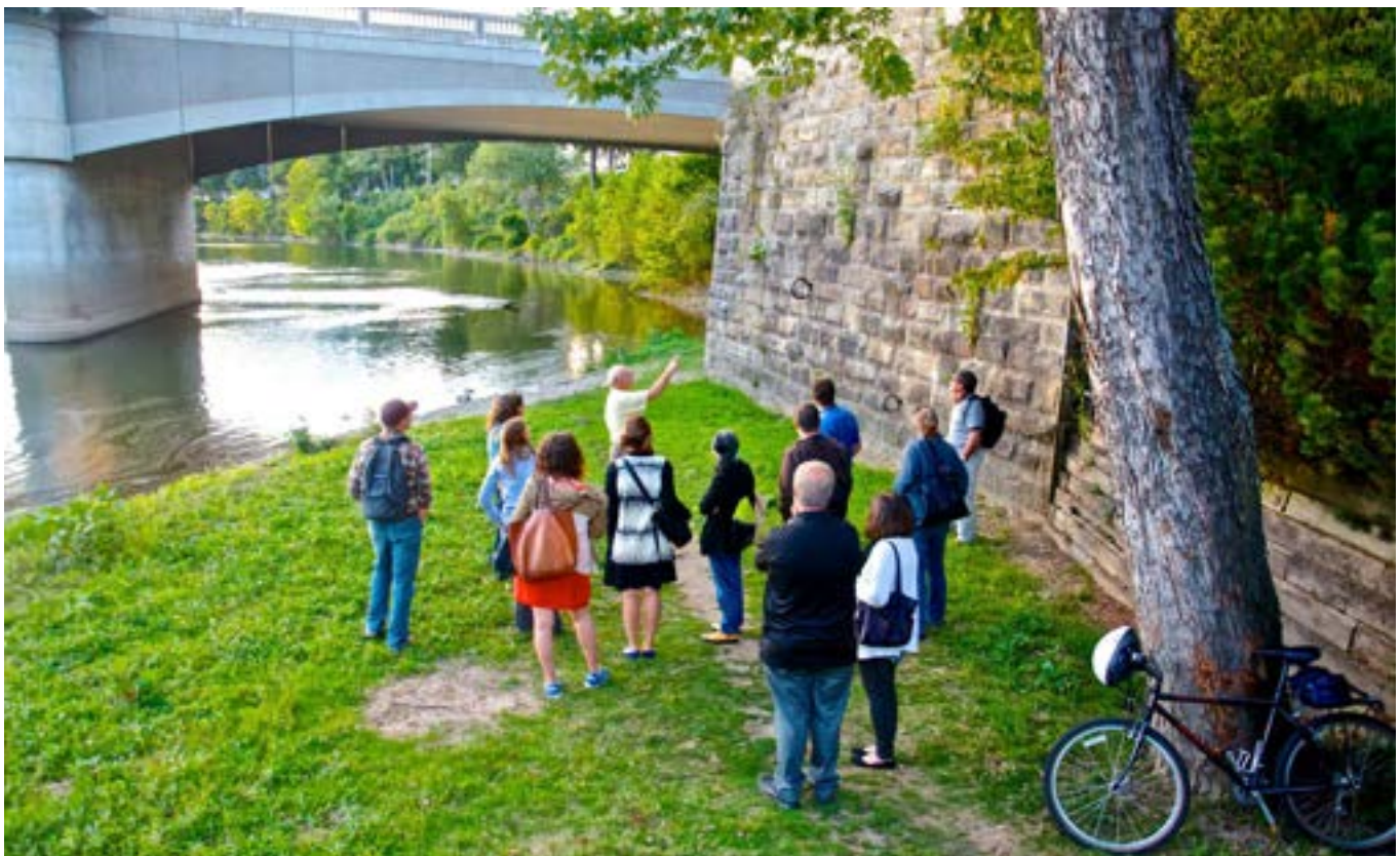
Historic Walking Tour along the Allegheny River in September during the Greenways and Trails Summit in Warren.

In June, DCNR released Pennsylvania's new five-year Outdoor Recreation Plan (2014-2019) that guides policies, priorities and investments related to outdoor recreation. To connect citizens to healthy outdoor recreation, the plan has five major priorities including health and wellness, local parks and recreation, tourism and economic development, resource management and stewardship, and funding and financial stability and includes 20 recommendations and 83 action steps. The completed plan keeps Pennsylvania eligible for federal Land and Water Conservation funding. The full plan and supporting documents, along with four training webinars, is accessible at www.paoutdoorrecplan.com . PRPS is an implementing Partner for 26 of its action steps.